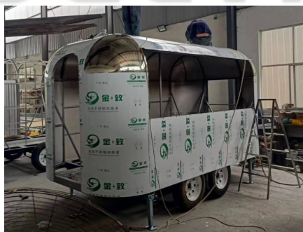
- Production -