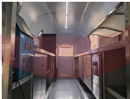
- Inside -