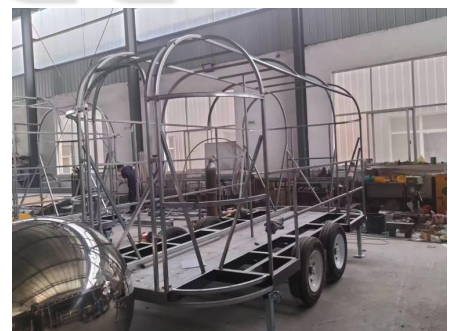
- Frame -