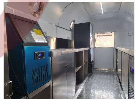
- Equipment -