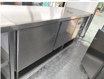
- Fridge -